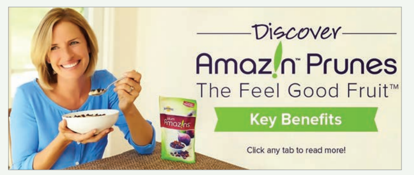
Are prunes good for "bone health"? Stay tuned.

"There's preliminary data from test-tube and animal studies that the polyphenols in prunes are