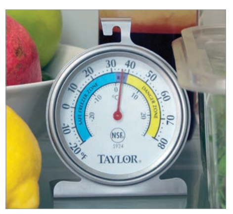
Stay cool. Put a thermometer in the fridge.

bowel syndrome (IBS), a mix of abdominal pain, bloating, cramping, gas, diarrhea, and constipation that's difficult to treat.