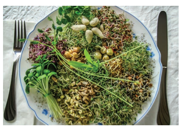
If you're pregnant, older than 65, a child, or have a weakened immune system, skip all raw sprouts.

faster and less expensive these days. "It used to be that when a patient went to a doctor or a clinic with diarrhea that