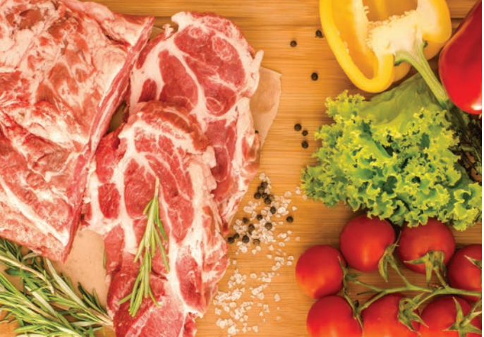
What's wrong with this picture? Never put raw meat and fresh veggies on the same cutting board.

Cryptosporidium infections cause watery diarrhea, stomach cramps, nausea, and vomiting. The illness usually lasts a week or two in healthy people but can be serious or even fatal in people with weakened immune systems.